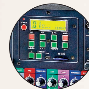
Mini USB port & SD card slot for transferring recorded audio to a computer for editing and archiving