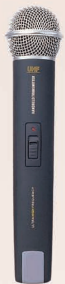
ENT-MIC-HH Handheld mic