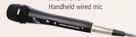
PADM-515 Handheld wired mic