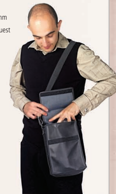
All Entertaina units come with a handy carry bag