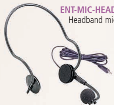
ENT-MIC-HEAD Headband mic

See page 21 for wired microphone options and additional accessories