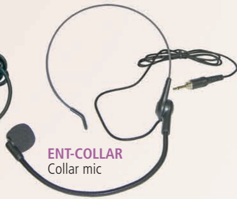
ENT-COLLAR Collar mic