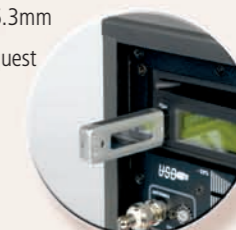
USB port for playing back downloaded audio and voice files