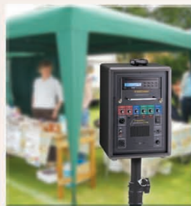
fetes... and much more