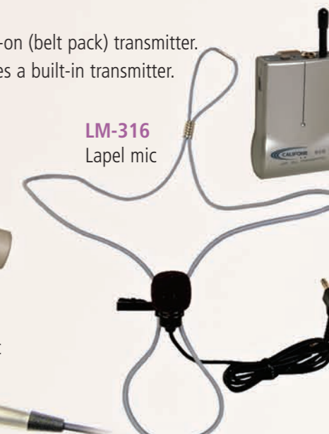
LM-316 Lapel mic