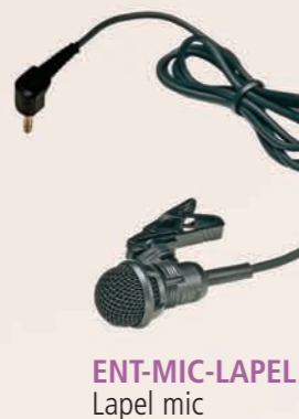
ENT-MIC-LAPEL Lapel mic