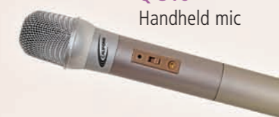
Q-316 Handheld mic