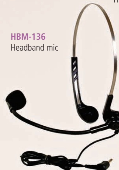
HBM-136 Headband mic